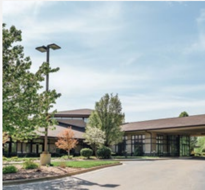
Faith Hospice at Trillium Woods 8214 Pfeiffer Farms Dr SW | Byron Center, MI 49315

Faith Hospice provides compassionate, dignified end-of-life care to all people regardless of their race, creed, religion, or financial status. We are blessed by faithful donors who make it possible to offer care to patients and their families who are unable to pay the full cost of our services.